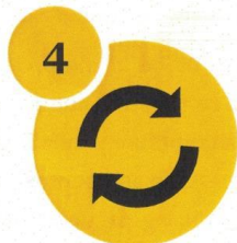
Participation & Accessibility