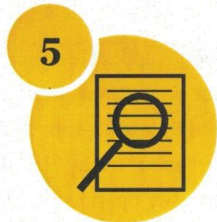
Commitment to learning