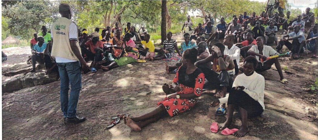
Cover: HANDLE programme team in Uganda through the community engagement session with the host and refugee women and youth